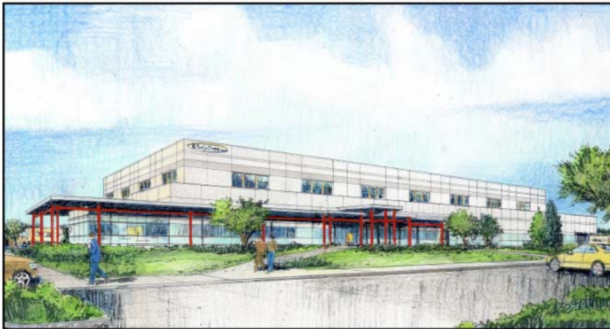
Pacific Cheese Processing Facility Amarillo, Texas