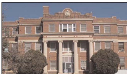
The Lynn County courthouse, Tahoka, Texas