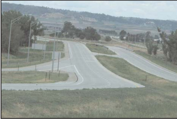
Figure 1 -- Scottsbluff/Gering Bypass

As the Ports-to-Plains Trade Corridor Coalition fulfills its mission to develop a "planned, multimodal transportation corridor including a multi-lane divided highway that will facilitate the efficient transportation of goods and services from Mexico, through West Texas, New Mexico, Colorado, and Oklahoma, and ultimately on into Canada and the Pacific Northwest," the role of the states that are along the Heartland Expressway and Theodore Roosevelt Expressway are important to understanding that mission. This month the focus is on Nebraska and its role in the economies of the Great Plains region.