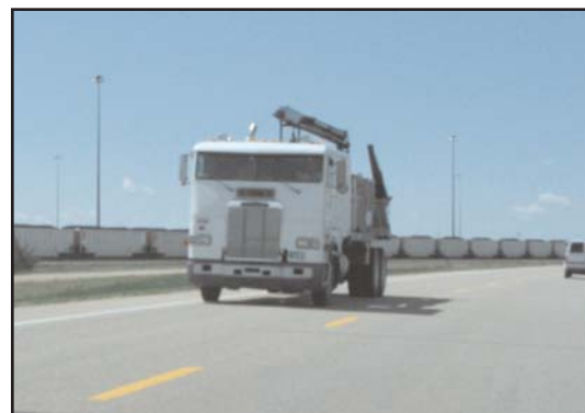
Figure 2 -- U.S. 385 at Alliance

Nebraska exports $5.5 billion and imports $1.6 billion annually with the eight Great Plains states. On the import side Nebraska's largest trading partners are Colorado ($722 million), South Dakota ($409 million) and Oklahoma ($181 million). Texas ($1.8 billion), Colorado ($1.3 billion) and South Dakota ($720 million) are the largest markets for Nebraska goods.