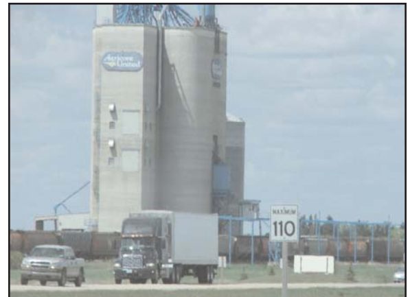
Figure 3 -- Canada Highway 11