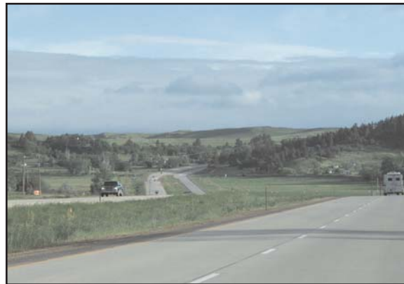
Figure 1-- US Highway 85 North of Spearfish, SD