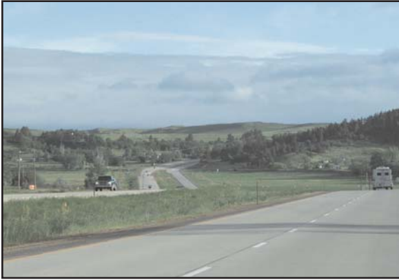
Figure 1-- US Highway 85 North of Spearfish, SD

Duffy was one of the first vehicles to be stopped and thus waited for 30 minutes while the traffic in the other lane passed through the construction zone. After passing through the twelve-mile construction zone, she counted the number of trucks now waiting to head south. There were 79 trucks in line in the south-bound lane. Estimating that the same number of trucks was also behind her in the north-bound lane after the half-hour wait, that 30-minute pilot car system affected the movement of approximately 158 trucks. It is a story we told all the way north.