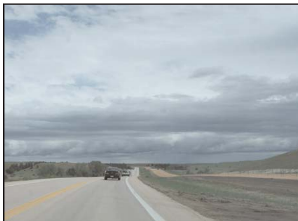
Figure 4 -- US Highway 79 Under Construction in South Dakota

Tuesday the day began with the long drive from Saskatoon through the international border crossing at Raymond, Montana to Plentywood, Montana for an afternoon community meeting. That evening they returned to Williston and had dinner with several of the Williston City Commissioners. Williston was challenged at the Chamber Luncheon and at this dinner meeting to step up and emulate the City of Lubbock's role in financially providing a strong base in the development of the Ports-to-Plains. The Williston Herald later wrote: "We want to thank the Ports-to-Plains organization for sending a team up North to re-energize our troops and get the TR Expressway off of dead center. As a result of their trip, the local TR Expressway board was reorganized, and even hired a summer intern to get the organization started. It is their plan to hire someone to take this responsibility on full-time sometime later this summer. TR