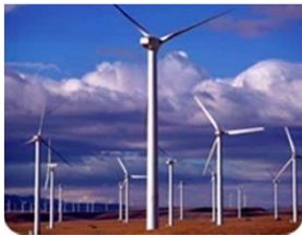
Rock River, WY 50MW