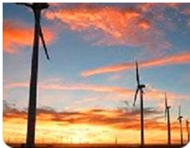
Colorado Green 162MW