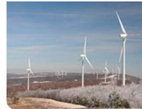
Mount Storm, WV 264MW