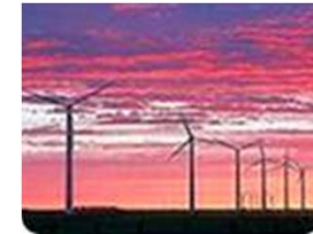
White Deer, TX 80MW