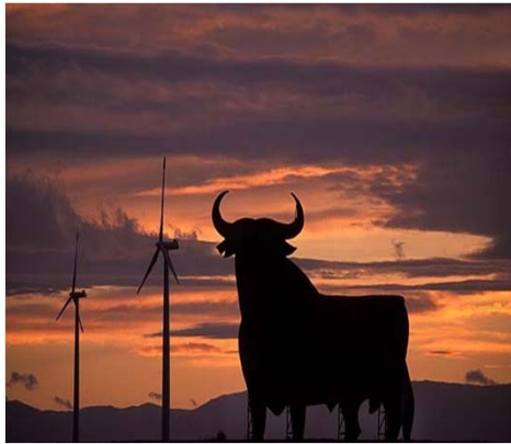
La Muela Zaragoza, Spain