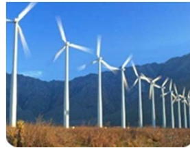
Cabazon Pass, CA 41MW