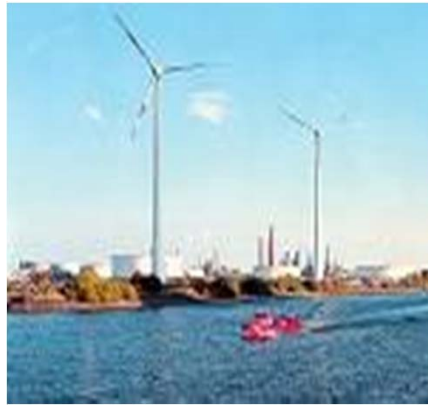
Harburg Hamburg, Germany