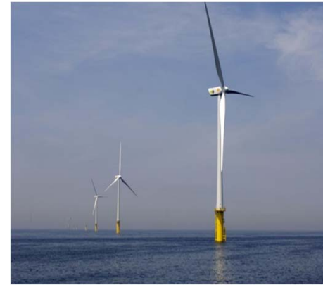
NoordZeeWind Egmond aan Zee, The Netherlands