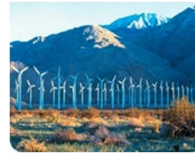
Whitewater Hill, CA 61.5MW