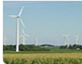
Top of Iowa 80MW