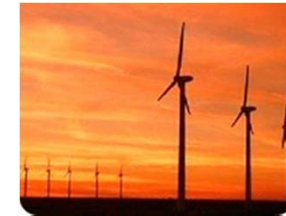
Brazos, TX 160MW